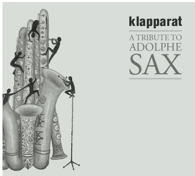
A TRIBUTE TO ADOLPHE SAX rec.2014